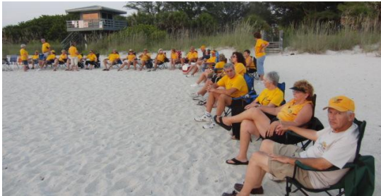
At the conclusion of the meeting many members gathered their chairs at the beach for the sun setting ceremony.