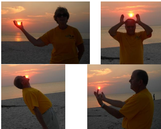
Some liberties with the sun were taken by our photographers.