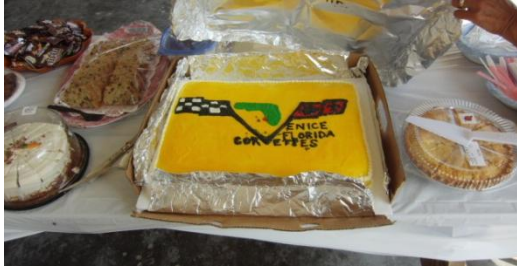
Along with the hamburgers and hot dogs members provided side dishes and desserts that covered three picnic tables