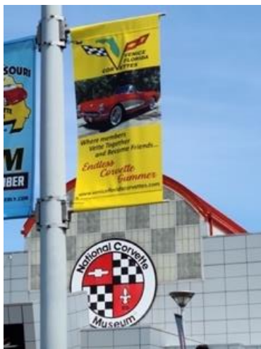
Our 2022 Banner at NCM

Click here for all the latest news from the museum