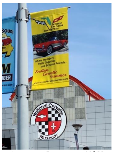
Our 2022 Banner at NCM