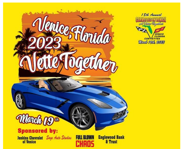
Our 2023 Show Shirt