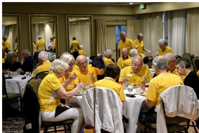
The venue – Venezia