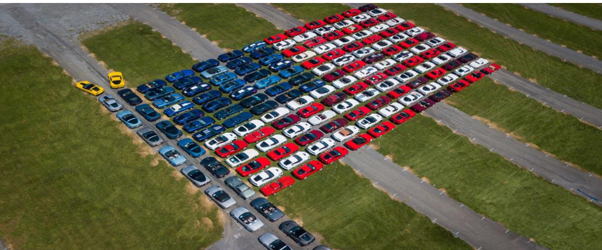
Corvette Flag at Carlisle from the Corvette Guys