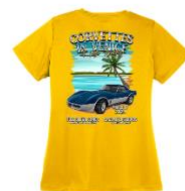
2024 Show Shirt