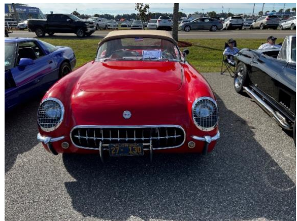
A beautiful 1954 Corvette in the Hagerty Car Show