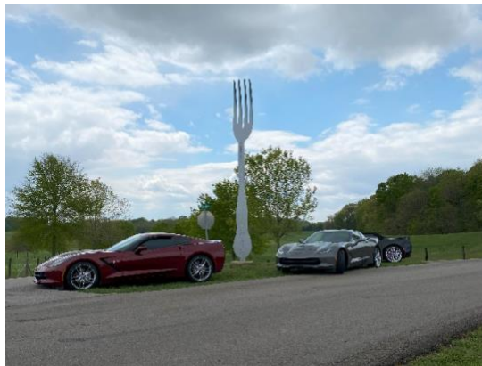
The Tracy's 2019 Long Beach Red Stingray at The Fork in the Road Franklin, KY