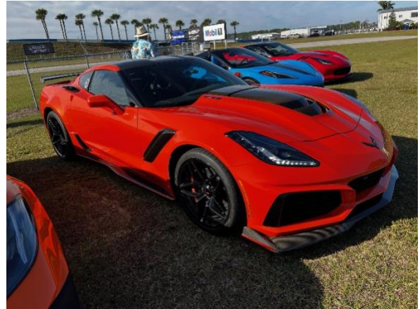
ZR1 C7 in the Corvette Coral

It was a sunny but windy day at Sebring this year. The Corvette Coral was packed. The Sportscar Vintage Racing Association (SVRA) RACES were awesome, and it's always an enjoyable drive to the track.