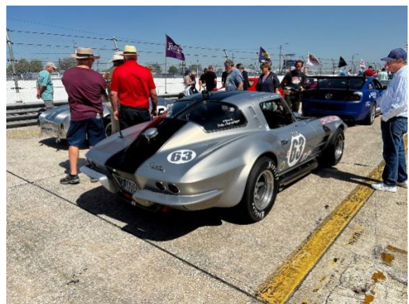
A split window took the checked flag in its class, unbelievable.