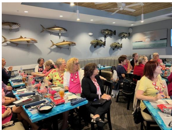
Attentively listening to the Fun Flamingo Facts.