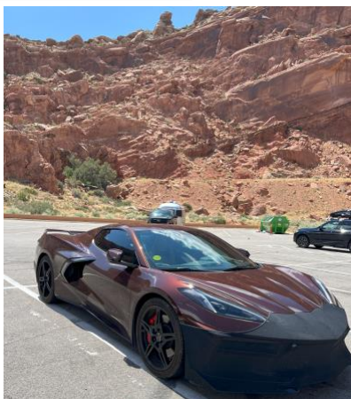
The Tracy's 2023 at Arches Nat'l Park Grand County, Utah