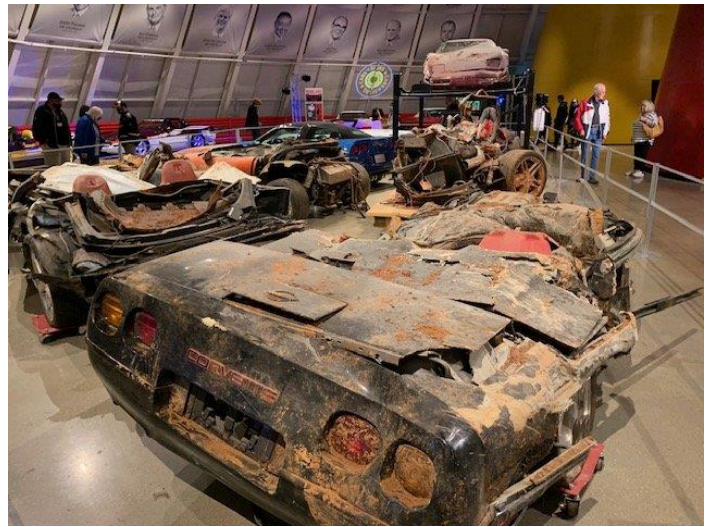
1993 ruby red "40th Anniversary Corvette