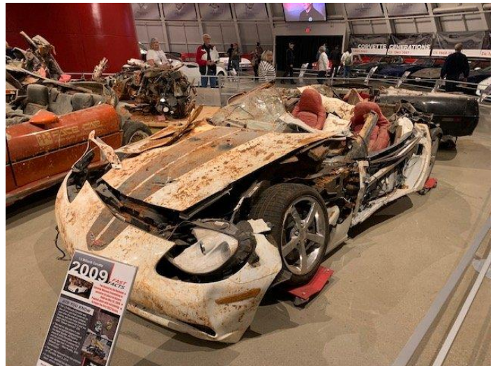
2009 white "1.5 Millionth Corvette