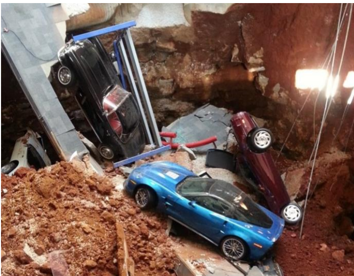
2009 ZR1 "Blue Devil